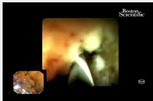
Figure 2: Cholangioscopy showing nodularity and neovascularization in the proximal CBD.