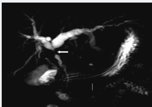
Figure 1: MRCP showing abrupt short segment cut off is noted near confluence of hepatic ducts with markedly dilated IHBR.

Ultrasound is helpful in patients with biliary stricture by demonstrating intrahepatic biliary radical dilatation and the level of obstruction. However, the distal part of the common bile duct is not properly evaluated because of the interference of bowel gas. Moreover, it has a very low yield for actual detection of strictures on biliary ductal masses [4]. The development of multi-detector helical scanners, used in conjunction with rapid injection of contrast media, accurate depiction of extension of the tumor, locoregional lymphadenopathy and encasement of blood vessels to determine operability of the tumor can be picked up easily.